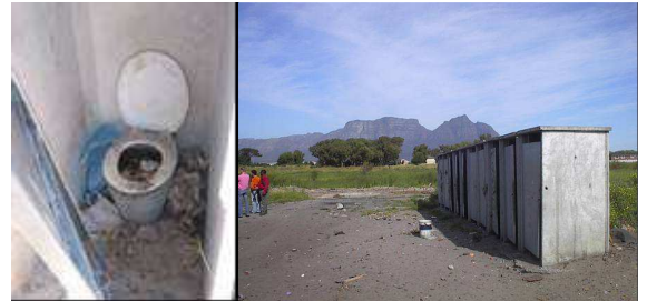
Example of current (shared) container toilets in one of the settlements. Because of shared responsibility between families these toilets are often poorly maintained

demonstration of a mobile sanitation system (MobiSan®) for application in the informal settlements of Capetown. MobiSan® will provide a flexible, community-based sanitation solution that fits the characteristics of the settlements and the needs of Cape Town Water Services, the organization that is responsible for the provision of basic services to these settlements.