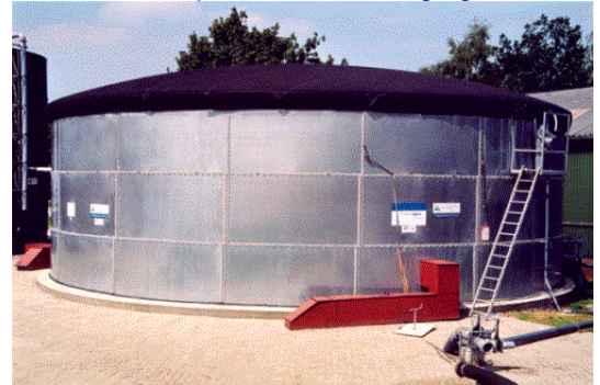
WUR-ASG digester in Sterksel

The centralised and decentralised (co-)digestion of animal manure for biogas production is popular in many countries, and the number of installations is increasing steadily. When looking at the large variety in used systems, from very high-tech to quite low tech, one is tempted to conclude that the technology and the processes behind it are rather straightforward. This is true up to a certain extent: it is easy to produce biogas from manure, either alone or in combination with other anaerobically degradable materials; this is a process that occurs spontaneously in many places in nature. The difficulties arise when the objective is to do this efficiently and with continuous stable production. In fact it is quite a challenge to achieve a continuous optimal biogas production from complex substrates, and more so when the digester loading and substrate composition are changing in time.